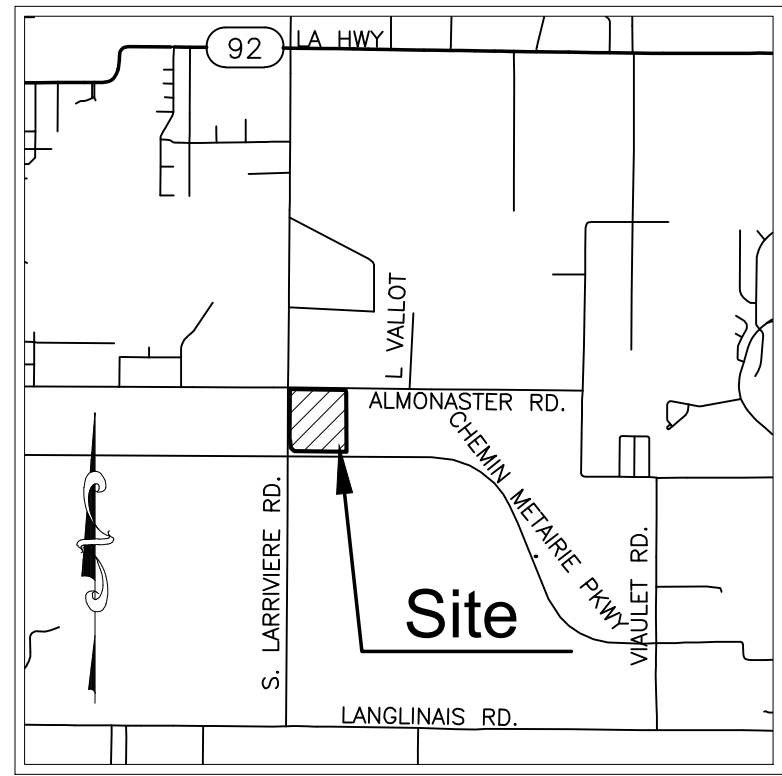
VICINITY MAP Scale: 1"=3000'±