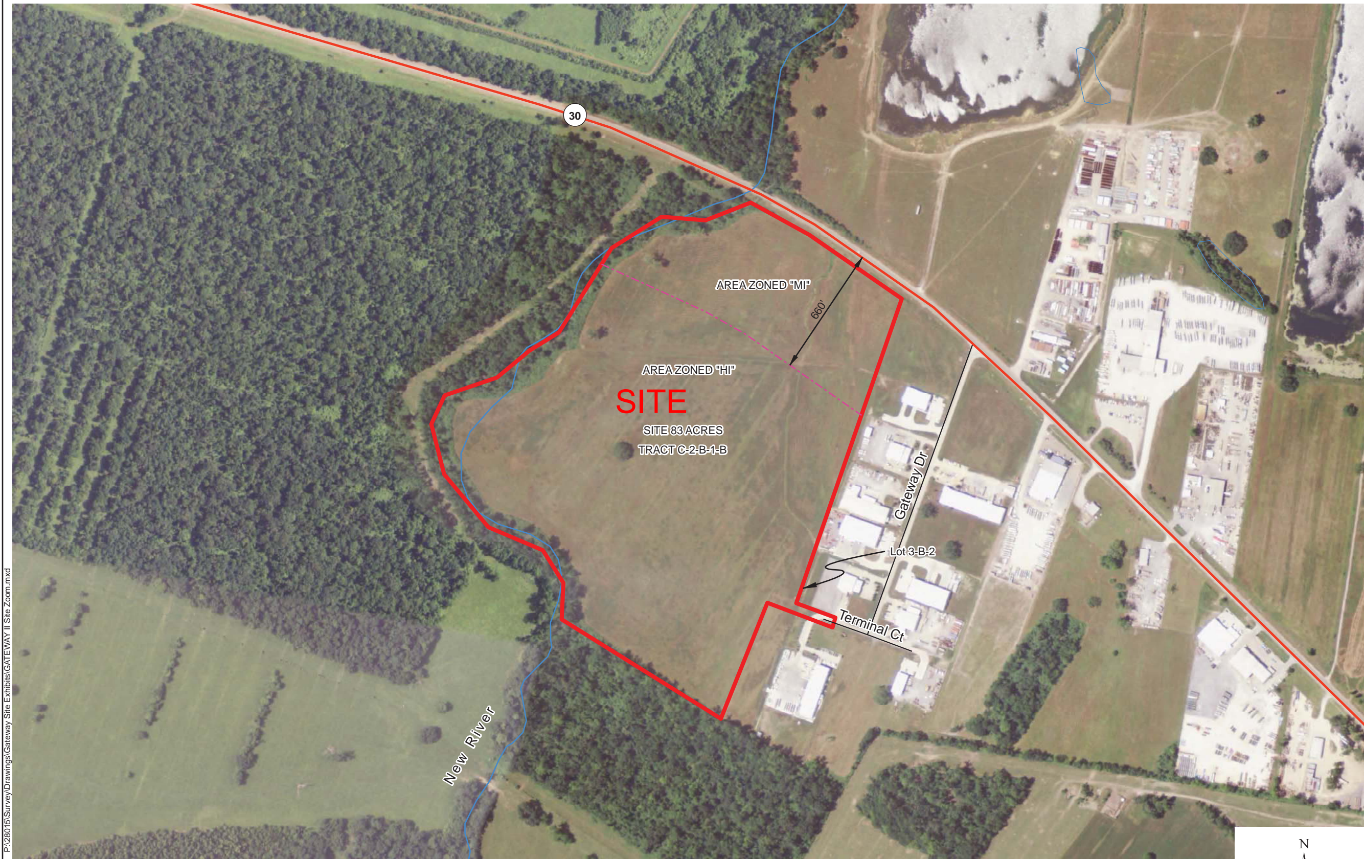
Exhibit D. Gateway II Site Zoning Districts Aerial Site Map

P:\28015\Survey\Drawings\Gateway Site Exhibits\GATEWAY II Site Zoom.mxd