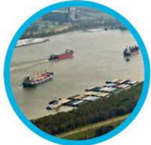
WATER TRANSPORTATION, DISTRIBUTION & LOGISTICS