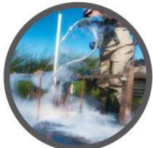
WATER, COASTAL, AND ENVIRONMENTAL INDUSTRIES