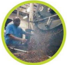
FOOD, BEVERAGE, FISHING, AND SEAFOOD