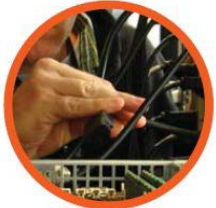
IT SYSTEMS AND PRODUCTS