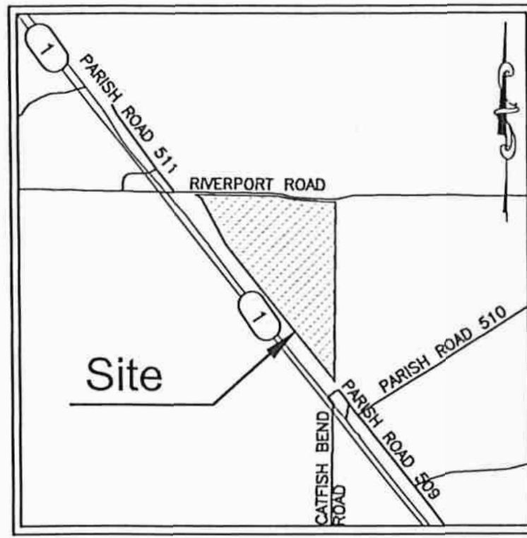
VICINITY MAP Scale: 1"=2000'±