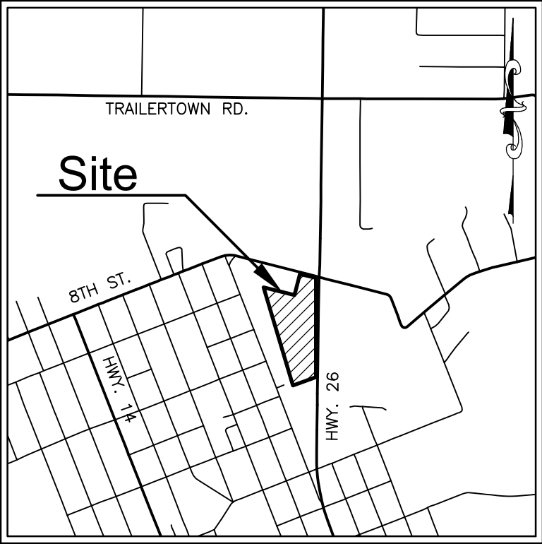
VICINITY MAP Scale: 1"=2000'±