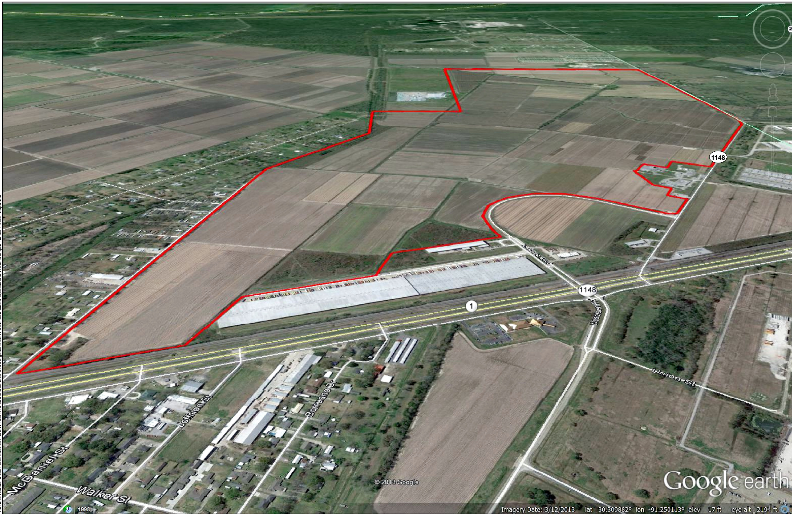
Exhibit Y. Dow Louisiana Operations West Oblique Aerial Photo Map

P:\212161\Sites Under Contract\007-DOW-Iberville 990\Maps and Drawings\Exhibit X Dow Louisiana Operations West Oblique Aerial Photo Map.mxd