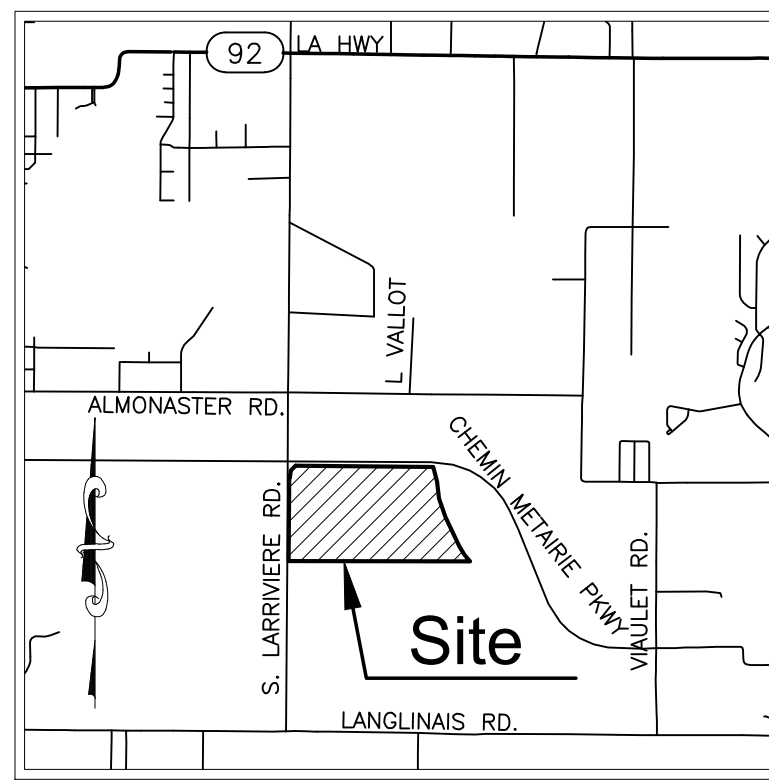
VICINITY MAP Scale: 1"=3000'±