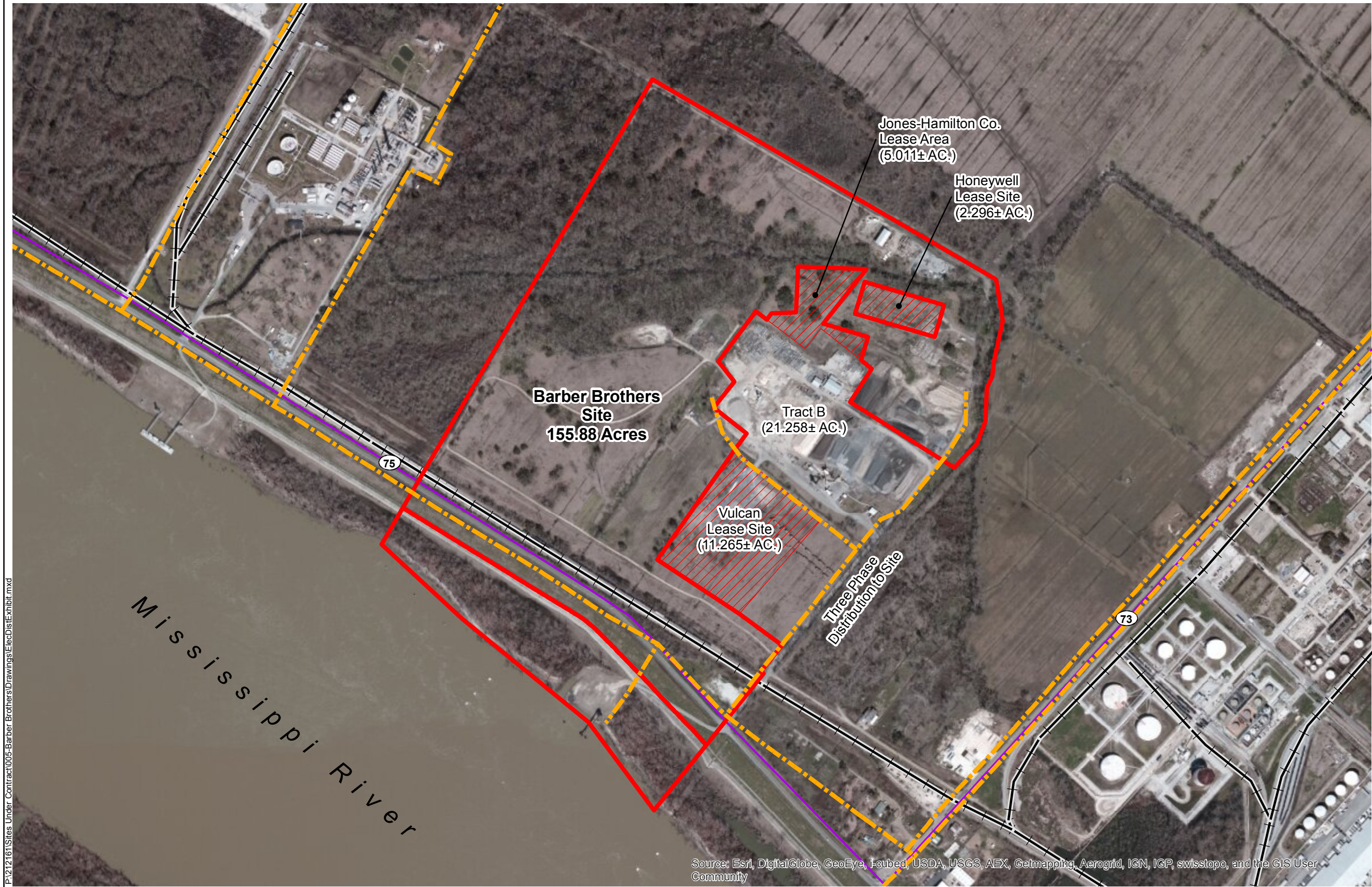
Exhibit O. Waterloo Site Electrical Distribution Infrastructure Map

P:\212161\Sites Under Contract\005-Barber Brothers\Drawings\ElecDist\Exhibit.mxd