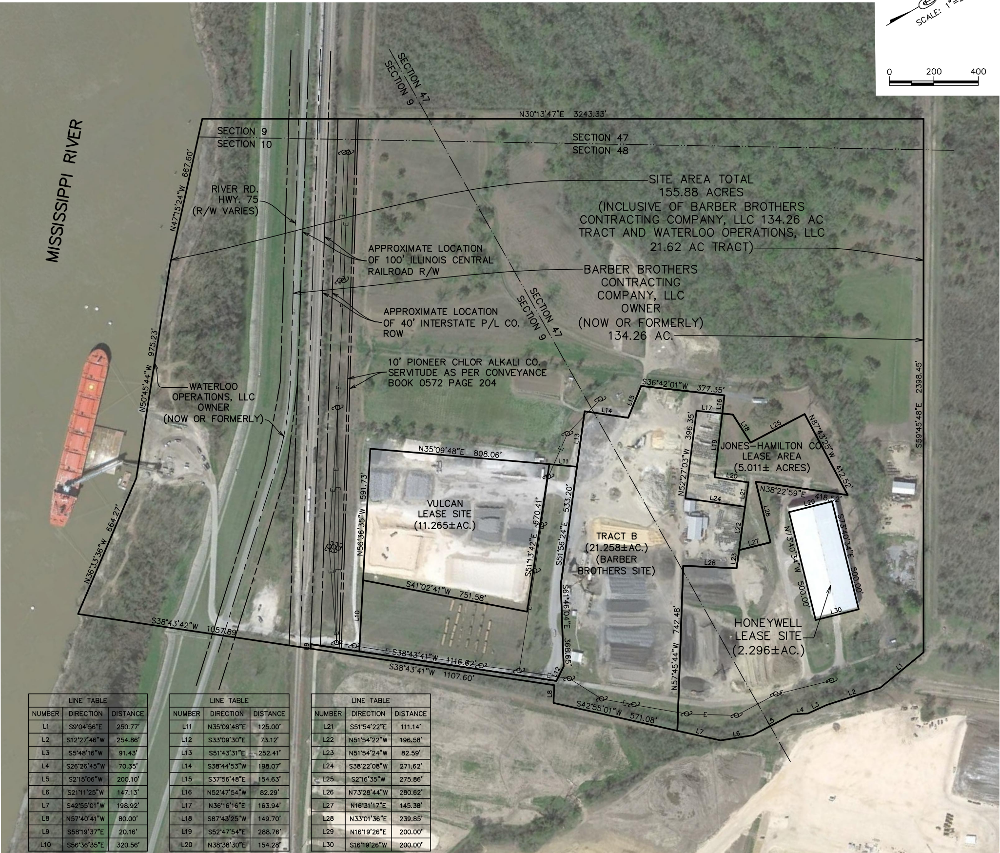
Exhibit H. Waterloo Site Property Boundary Aerial Survey