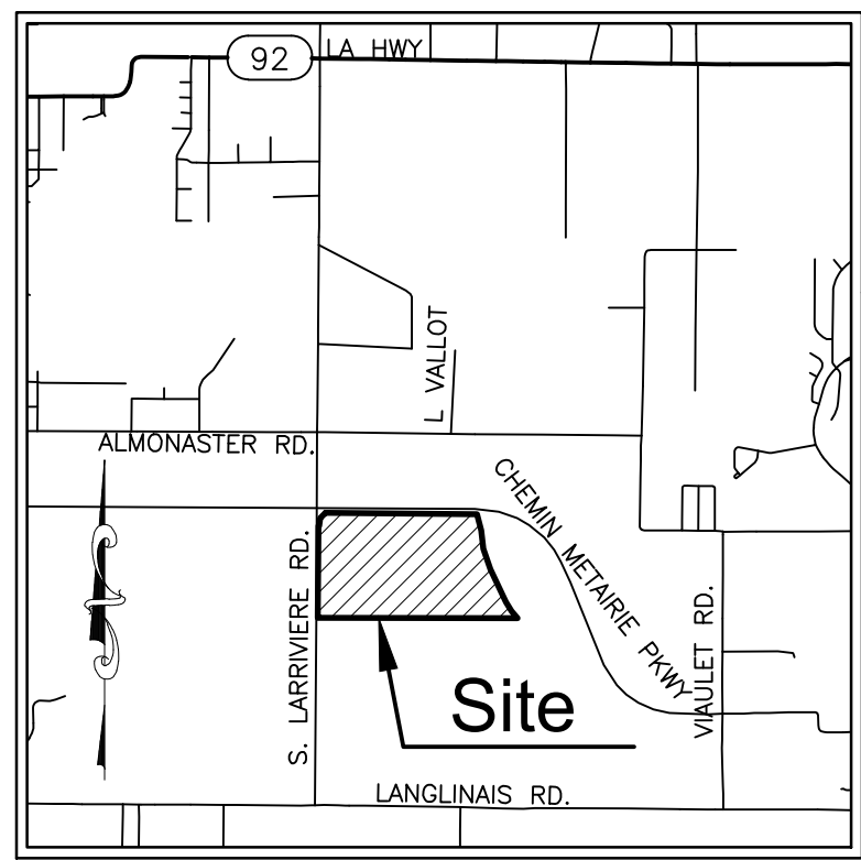
VICINITY MAP Scale: 1"=3000'±