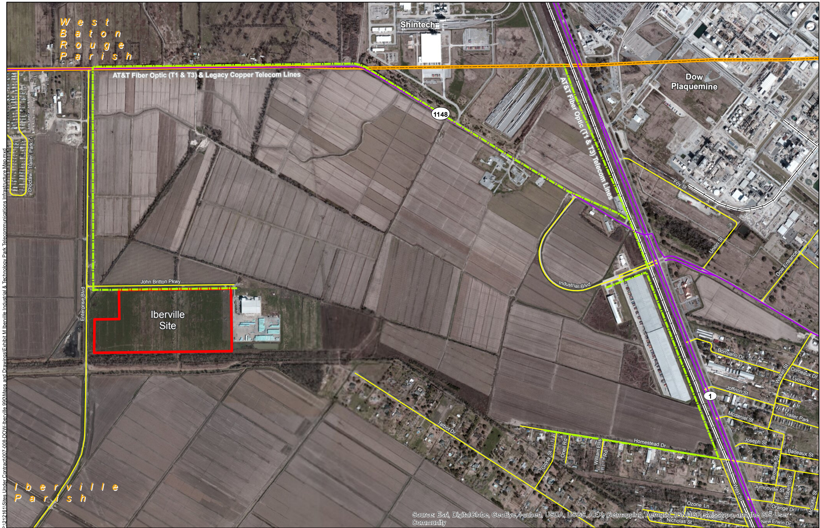
Exhibit M. Iberville Industrial & Technology Park Telecommunications Infrastructure Map

P:\212161\Sites Under Contract\007-008-DOW-Iberville 990\Maps and Drawings\Exhibit M Iberville Industrial & Technology Park Telecommunications Infrastructure Map.mxd