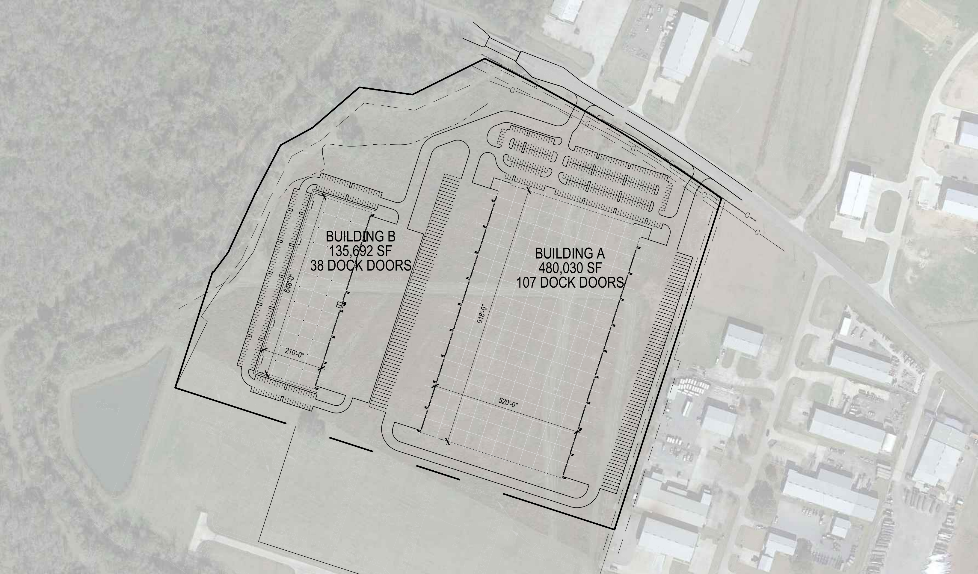
MASTER PLAN OPTION - 615,722 GSF, 145 DOCK DOORS, 550 PARKING, 143 TRAILER | GATEWAY BUSINESS PARK GEISMAR, LOUISIANA