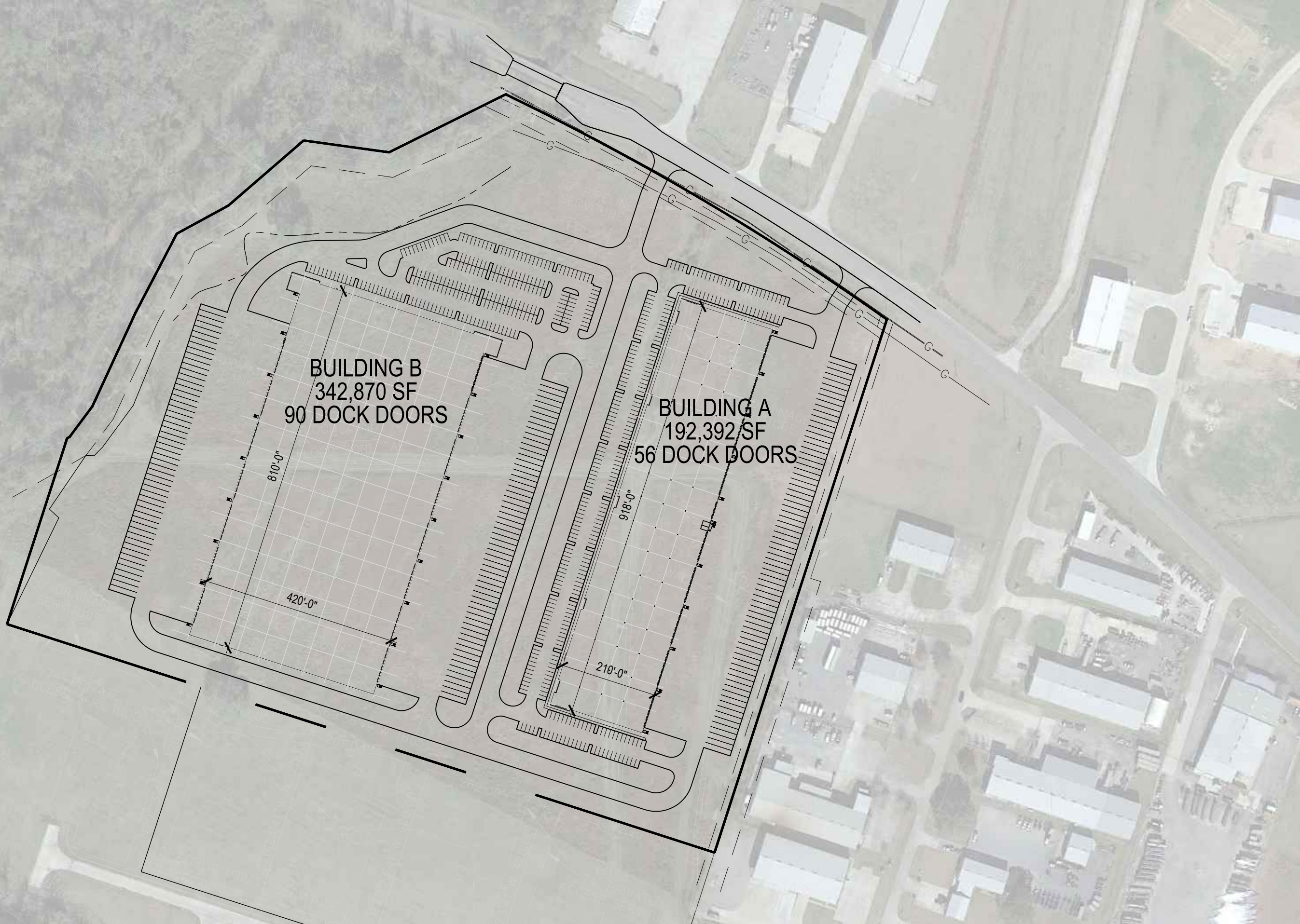
MASTER PLAN OPTION - 535,262 GSF, 145 DOCK DOORS, 528 PARKING, 188 TRAILER | GATEWAY BUSINESS PARK GEISMAR, LOUISIANA