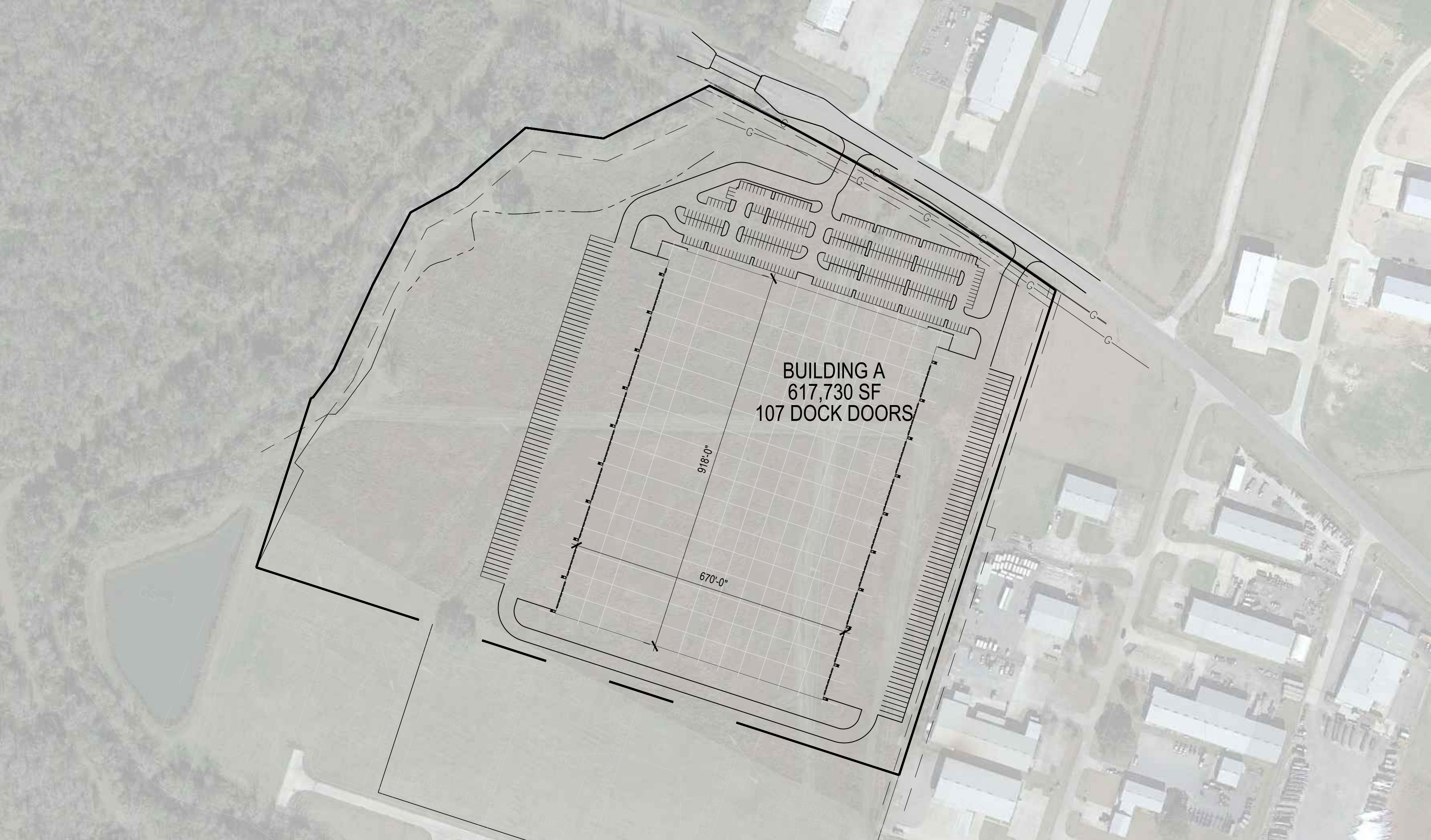
MASTER PLAN OPTION - 617,730 GSF, 107 DOCK DOORS, 361 PARKING, 143 TRAILER | GATEWAY BUSINESS PARK GEISMAR, LOUISIANA