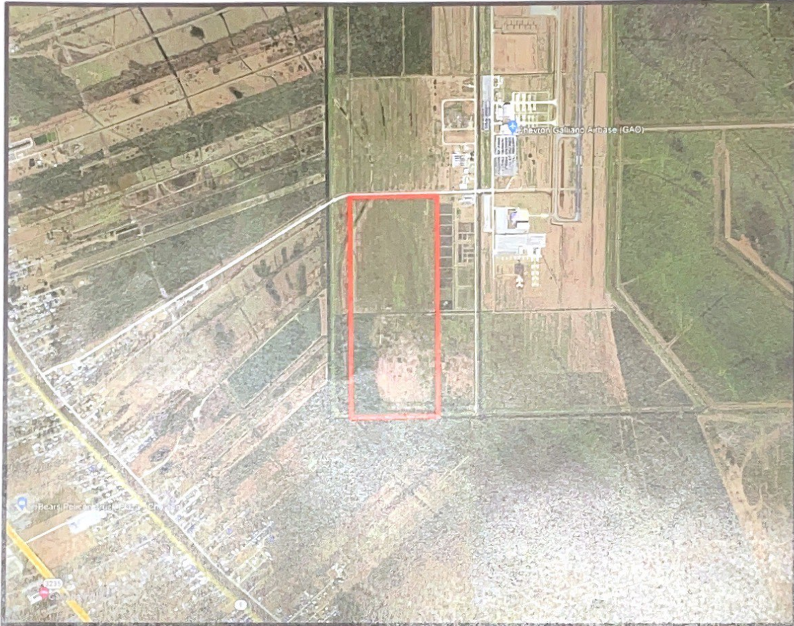
Exhibit A: South Lafourche Airport South Site