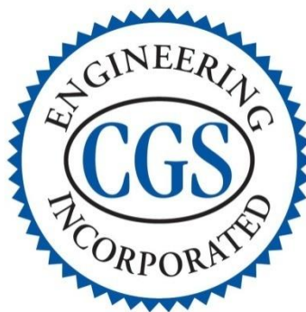
Exhibit 24 Geotechnical Report

City of Natchitoches Highway 478 Development Tract