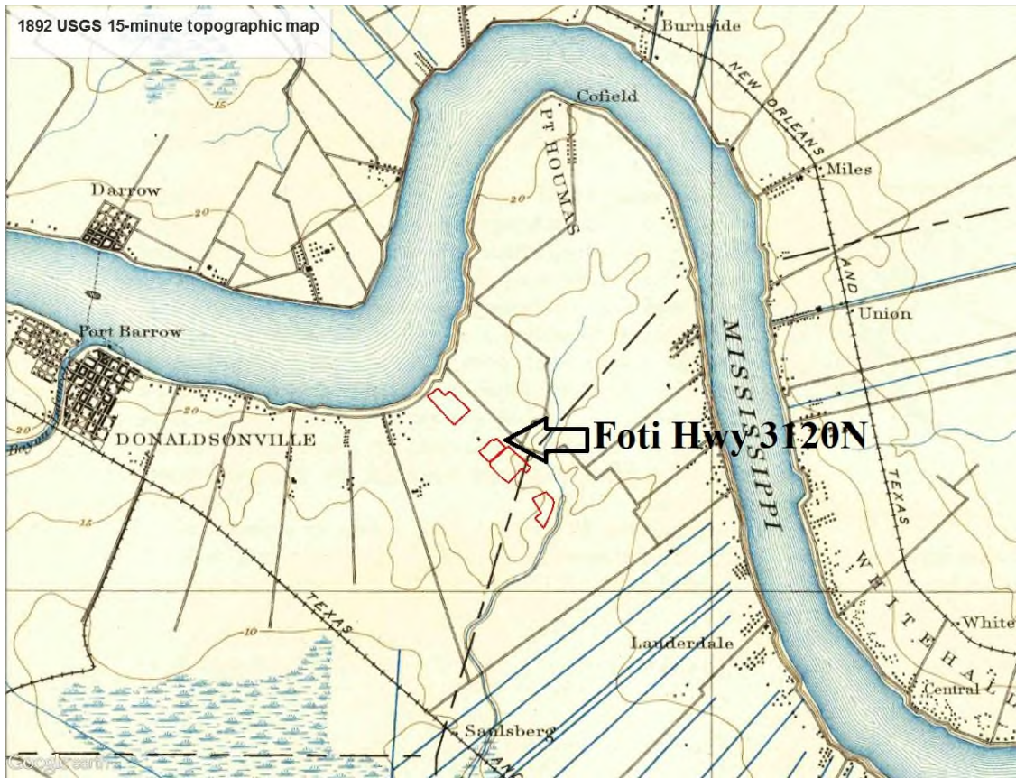
Figure 4. Portion of USGS 1892 15-minute topographic map.