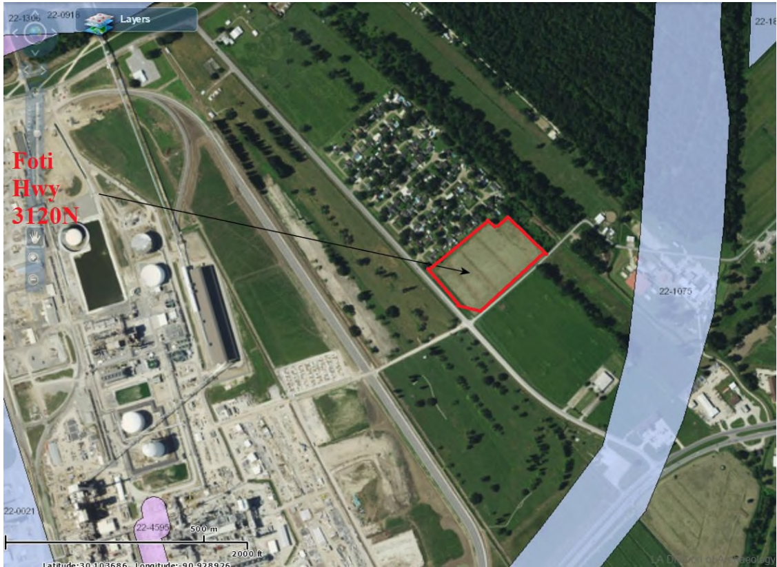
Figure 2. State Cultural Resources Map showing project area.

An examination of the cultural resources map indicates that the project area does not possess recorded archaeological sites, nor has it been previously archaeologically surveyed (Figure 2). In the map blue/purple shaded areas indicate previous surveys, while orange polygons show archaeological sites.