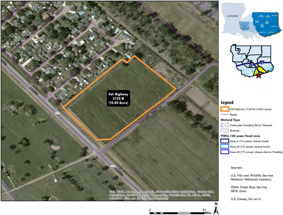
Figure 1. Project Area.

This report addresses a request from DDG/BRAC to review the cultural resources status of a 10 acre site in Ascension Parish, Louisiana, proposed for certification under the small sites certification program. This site is just east of Donaldsonville, on the right descending side of the Mississippi River and is named the Foti Hwy 3120N site (Figure 1). In accord with the LED requirements, the State Cultural Resources map was checked to determine if there were any known cultural resources within the project area, and also to find out whether the project area had been previously surveyed archaeologically.