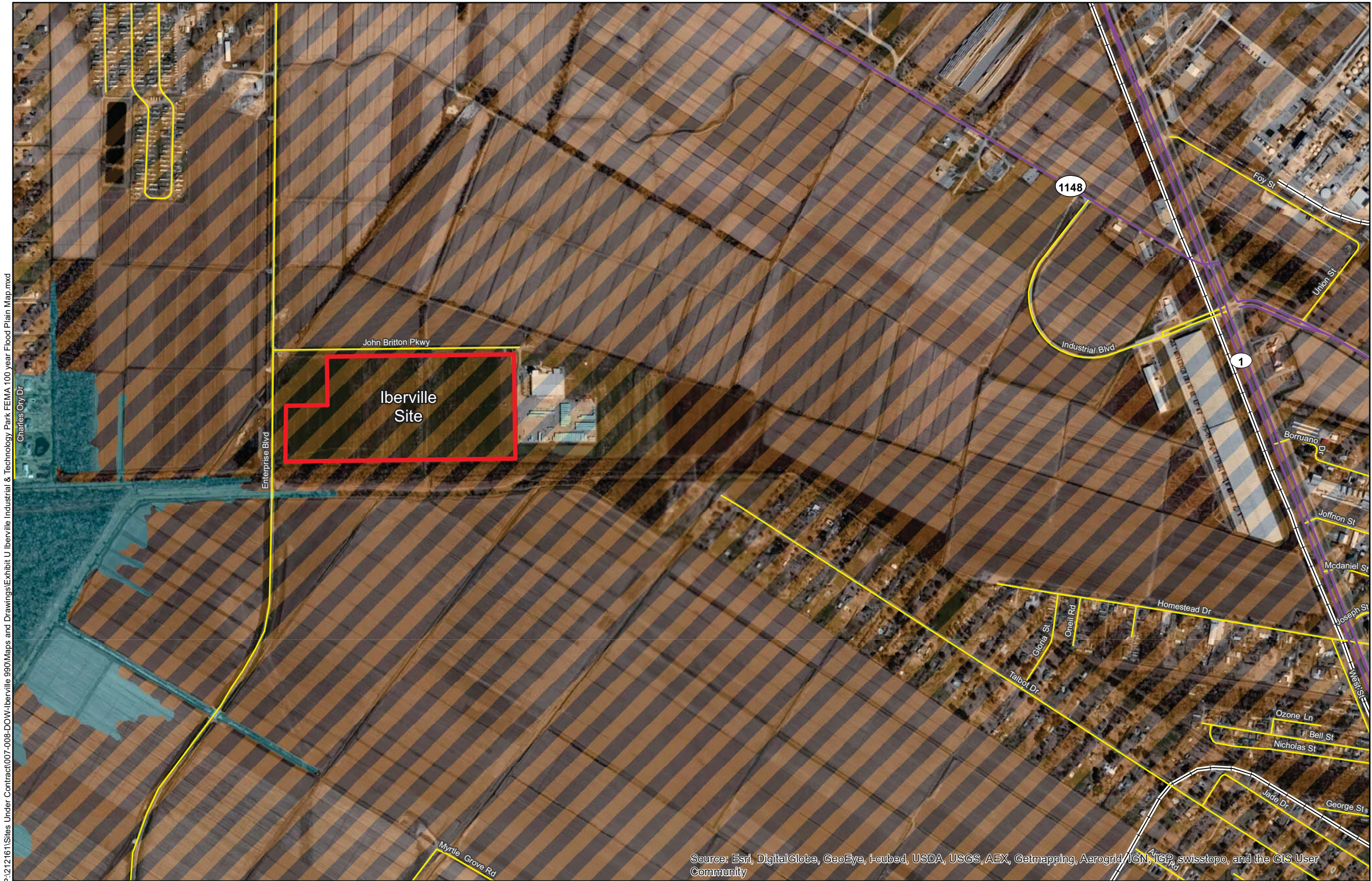
Exhibit U. Iberville Industrial & Technology Park FEMA 100 year Flood Plain Map

P:\212161\Sites Under Contract\007-008-DOW-Iberville 990\Maps and Drawings\Exhibit U Iberville Industrial & Technology Park FEMA 100 year Flood Plain Map.mxd