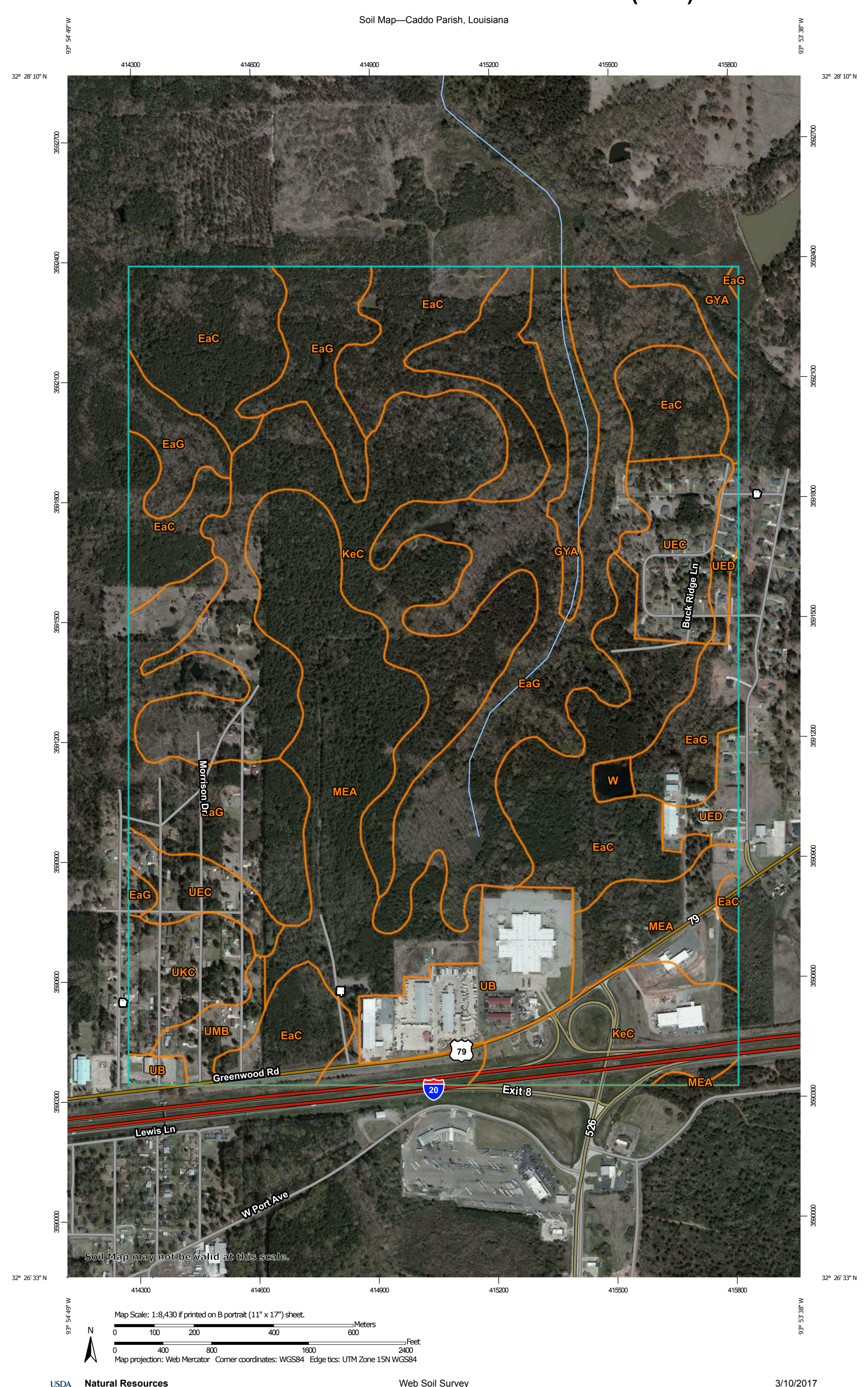
EXHIBIT 11 - NRCS (SCS) SOIL MAP