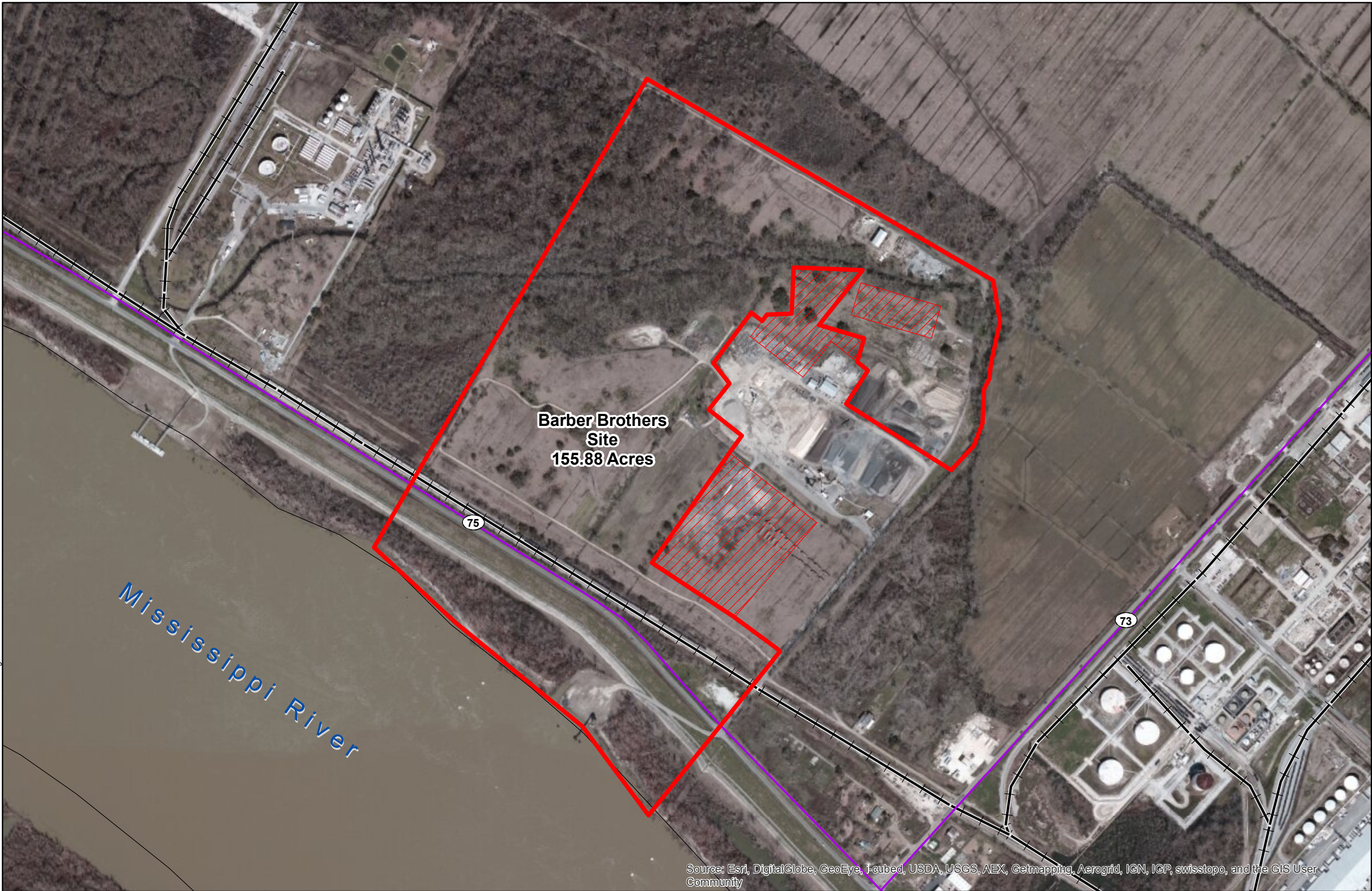
Exhibit DD. Waterloo Site Color Aerial Photo Map

P:\212161\Sites Under Contract\005-Barber Brothers\Drawings\Site Exhibit.mxd